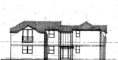
FOUR FLATS - REFUSED - ELEVATION